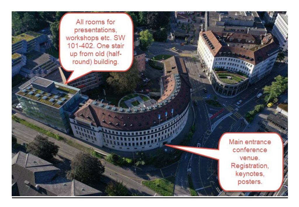
Aerial Photograph Conference Venue